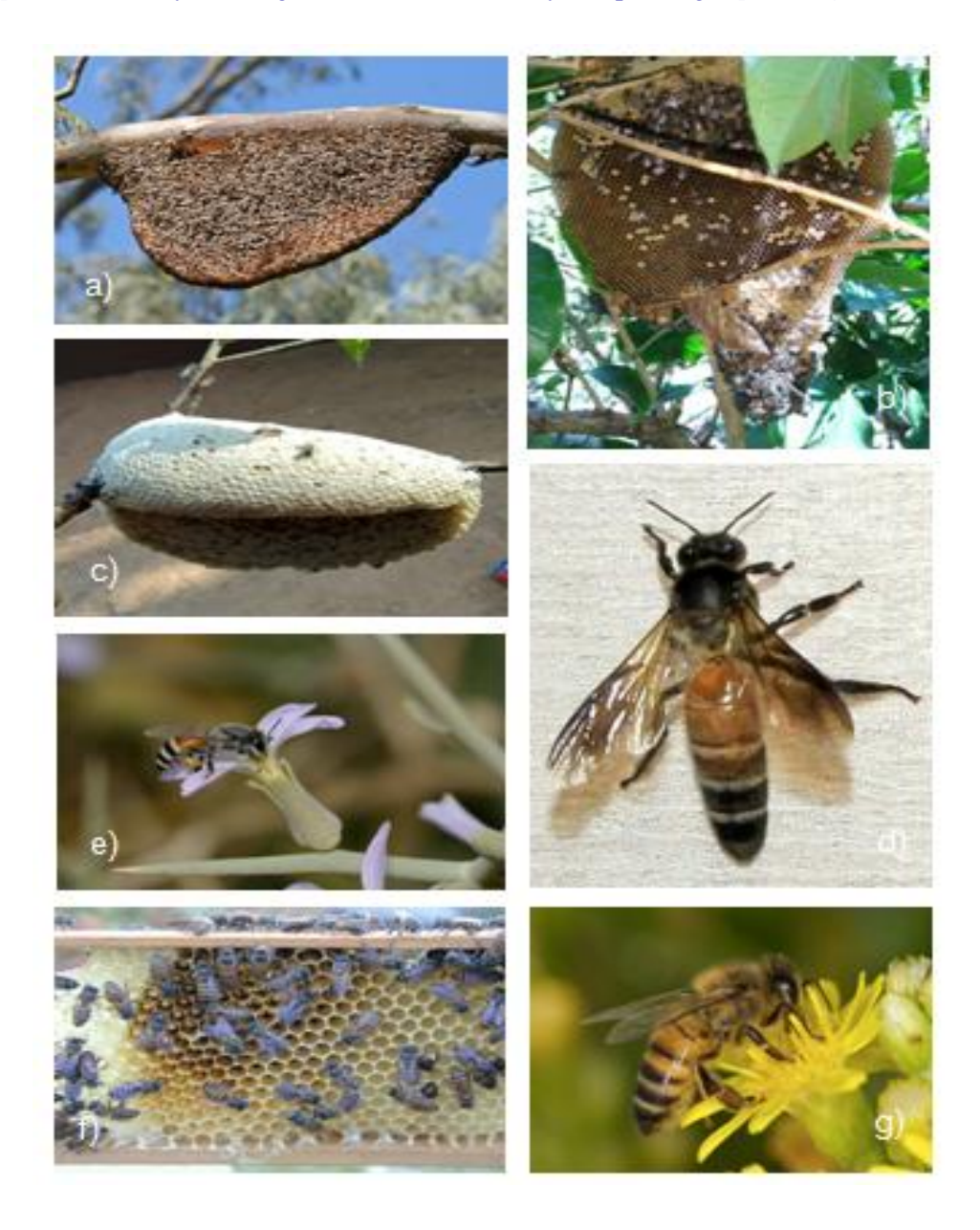
Fig.1 Description of the different honeybees identified in Bengaluru a) Rockbees; Apisdorsata b) Apisflorea comb showing the brood; c) Apisflorea brood showing honey storage area; d) Apisdorsata worker bee e) Apisflorea worker bee f) Apiscerena colony showing brood and stored honey and pollen g) Apis mellifera collecting pollen and nectar.